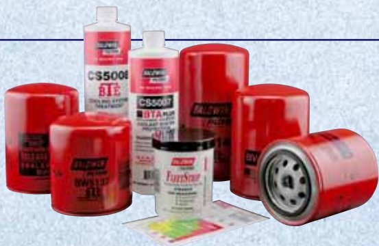
Baldwin Filters' coolant filtration line includes high quality additives such as BTE, BTA PLUS, coolant system cleaners and heavy-duty filters.

Baldwin Filters' FleetStrip™ kit is a one-step way to test your coolant system. Equally important, it's universal—making it easy to monitor any type of conventional coolant formulation. Find out how FleetStrip can aid your maintenance program with coolant testing that's fast, precise and affordable. See your Baldwin Filters distributor today for details about FleetStrip and Baldwin Filters' complete line of coolant filtration products.