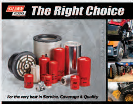
POS Poster – No Charge – Size: 17" x 22"