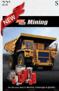
Mining Poster Form 819 – No Charge – Size: 17" x 22"