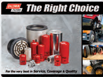
Counter Mat – No Charge – Size: 14" x 19"

Baldwin Filters' Brand Builder Program offers affordable point-of-sale materials to conduct a successful local marketing program while promoting your business and the Baldwin Filters brand. By selecting just the items you need, you can personalize a point-of-sale program right for your business and your budget.