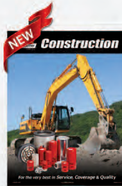
Construction Poster Form 817 – No Charge – Size: 17" x 22"