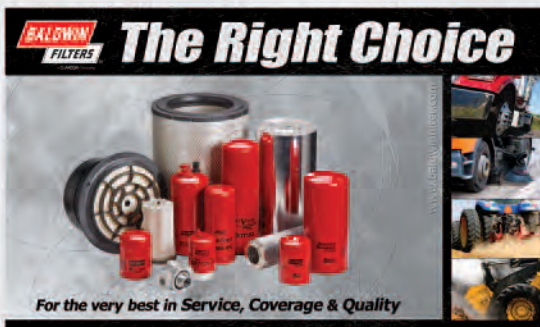
POS Banner – $10.00 – Size: 3' x 5'