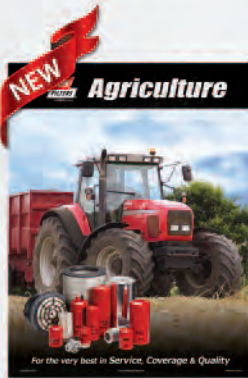
Ag Poster Form 816 – No Charge – Size: 17" x 22"