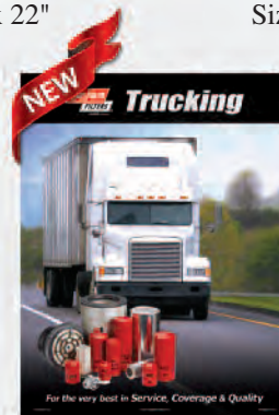
Truck Poster Form 820 – No Charge – Size: 17" x 22"