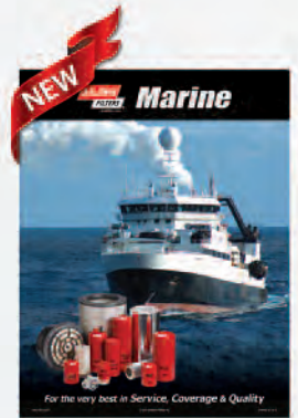
Marine Poster Form 818 – No Charge – Size: 17" x 22"