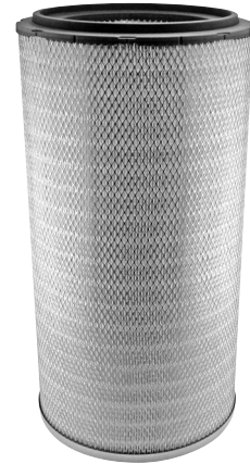
New Style One End

This is to alert you to changes on certain Axial Seal air filters. A recent project replaces the steel end caps on several of our axial seal filters with urethane. The benefits of this change include the use of environmentally friendly materials, eliminating gasket adhesion concerns, superior gasket sealing properties, and an improved appearance. The first of these products to receive the new technology will be the PA2661. Due to some unique end caps, not all products will receive changes to both ends. Attached is a list of products with estimated implementation dates. Please note that these dates are estimated due to varying amounts of use up of existing stock. This list is not complete, and any axial seal air filter with steel end caps could potentially receive these improvements going forward.